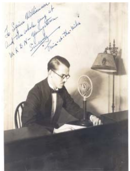
Signed promotional photograph from WTAM's "Ernie at the Mike"

Also included in the scrapbook is an outline on the early history of radio waves and drawings done by Williamson; a collection of letters involving tree trimming to remedy interference with radio waves; autographed photographs and a full page Youngstown Vindicator spread detailing the new studios. Items like these show Williamson, Chorpening and Brock as true pioneers in radio, as they were involved with all aspects of early broadcasting. Visit mahoninghistory.org to see more items from the scrapbook.