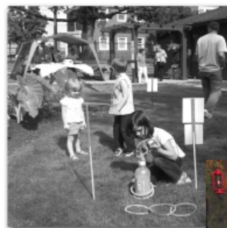
Kids enjoyed the Founders Day Open House and the Holiday in Motion Display in 2009.

◆ Historical Society Board Members, staff and volunteers collaborated with community programs such as: First Night Youngstown; YSU Summer Festival of the Arts; Leadership Mahoning Valley; YSU English Festival; CityScape/Street Scape Planting Day; YSU Homework Express; St. James Episcopal Church Bicentennial Celebration; Winter Celebration at the Davis Garden Center, Mill Creek MetroParks.