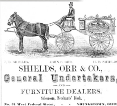
Advertisement from 1875 City Directory