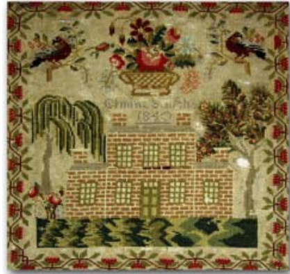
Elmina Smith 1840 Sampler

Samplers of the 17 th century and beyond usually included numerals and letters, preparing girls for marking dates and initials on family linens, a responsibility they would assume upon becoming housewives. Samplers were worked both in schools and at home and demonstrated both simple and complex, decorative stitches. They might feature floral patterns, inscriptions