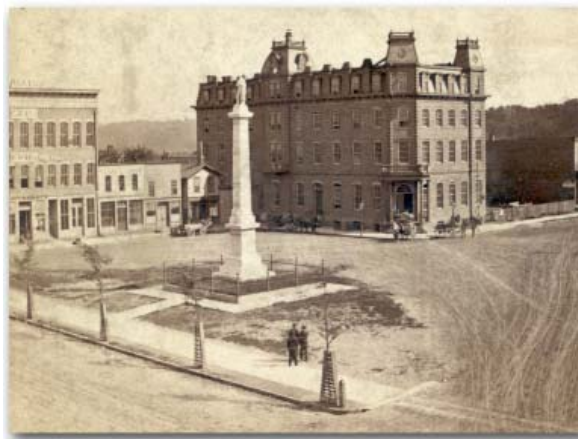
Tod House & Civil War Monument ca. 1870

Enormous growth was happening in the Mahoning Valley in this time period, which continued through the early decades of the 20th century. In the next few issues of Historical Happenings watch for more articles on the people, businesses, and organizations that were thriving in 1875. ☘