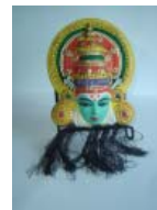
Mask from India

Irish-American: learn the cultural heritage of local residents who are of Irish descent