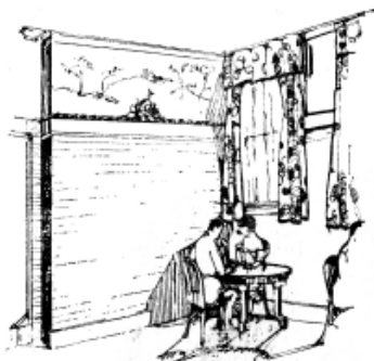
Peacock Banquet Room

The second floor Rainbow Assembly room and the Peacock Banquet Room on the mezzanine, were open and beautifully appointed spaces at Burt's. The grand staircase provided a centerpiece between the two rooms and included a balcony to look over the large ballroom; while the floor to ceiling windows overlooking downtown and the hillside to the north provide a fitting backdrop. Again, we visit Mr. Burt's souvenir booklet from 1922 for a description of the second floor: