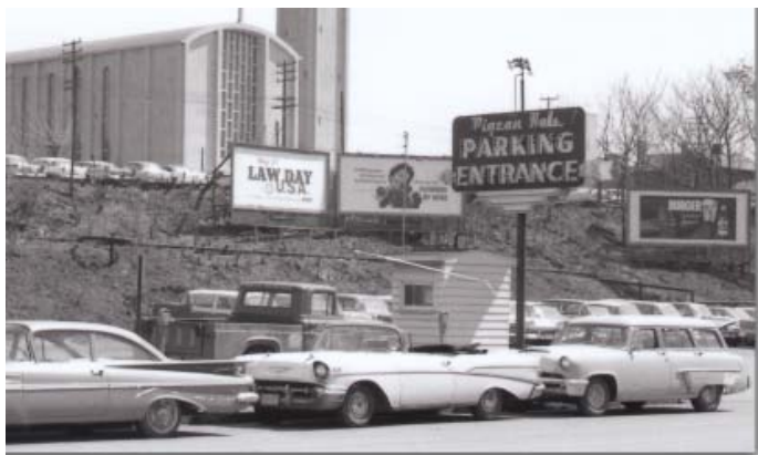
Entrance to the Pigeon Hole Parking complex on Commerce Street, 1961. This site is now occupied by the Youngstown Historical Center of Industry and Labor (Steel Museum).