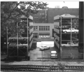
View of the Pigeon Hole Parking from Wood Street, 1961.