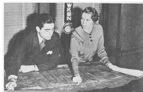
Al & Molly O'Day going over the home's plans