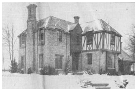
4500 Rush Boulevard

Business & Media Archives of the Mahoning Valley