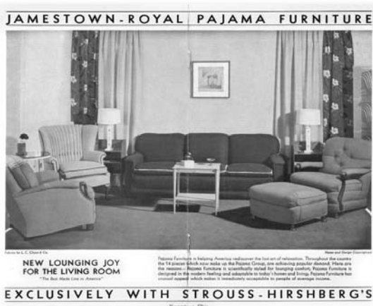
An ad from the open house booklet. This furniture set cost $418.00 in 1936

The estimated cost in 1935 was $18,000 for the 2100 square foot home (over $275,000 in 2009 dollars). It was billed as the "Home of the Future" with the most exciting feature being an integrated radio system – radio sets were not visible, instead a master radio was installed in a closet with hidden speakers throughout the house. Hundreds of contractors and vendors donated materials, labor and furnishings for this home, and it welcomed large crowds at its opening