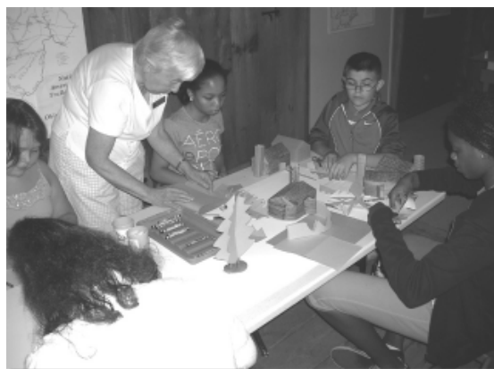
Campers make a log cabin village, complete with trees!